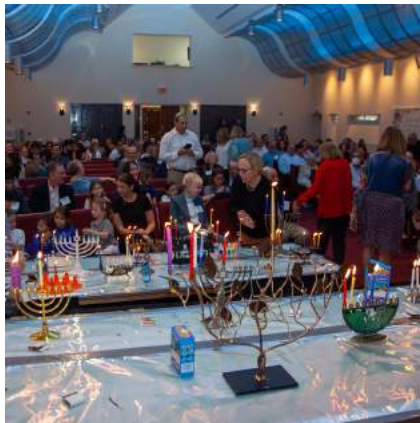
The glow from the menorahs added warmth to the celebration.