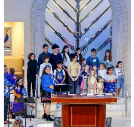
TI children receiving a Blessing on the Bima