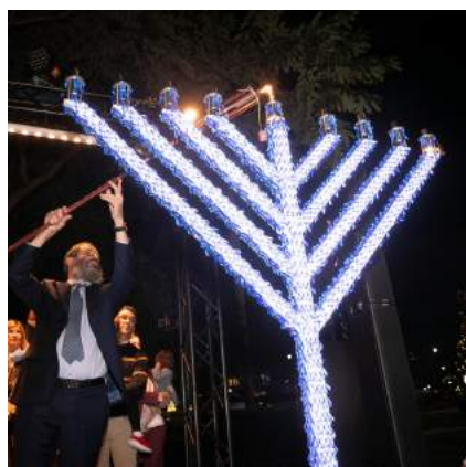
The lighting of the Menorah, wrapped in blue ribbons.