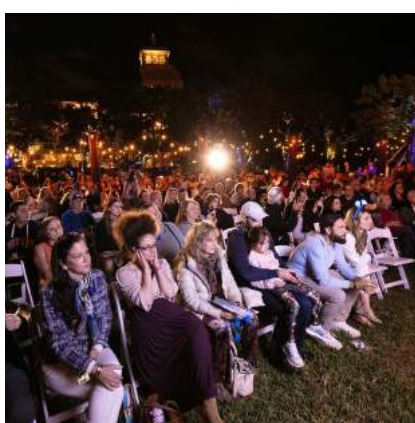
The event had a huge turnout!