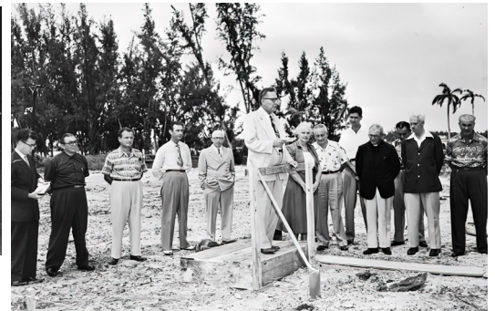
(1951) Groundbreaking for TI on Flagler Drive