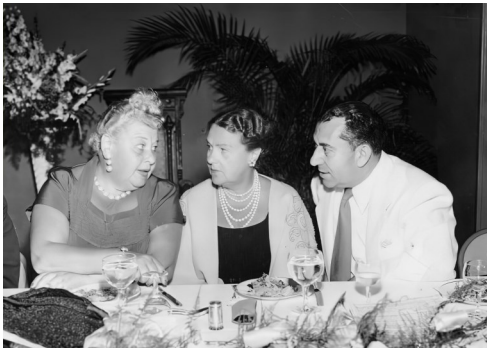
(1952) Sophie Tucker at a fund-raising event for TI

In addition, we're asking if anyone can identify the people pictured in the below photos. Could this be you or someone you know?