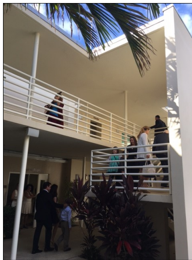
(below) Families sang and marched from the Kraft Sanctuary to the Media Center during the High Holy Days family service.