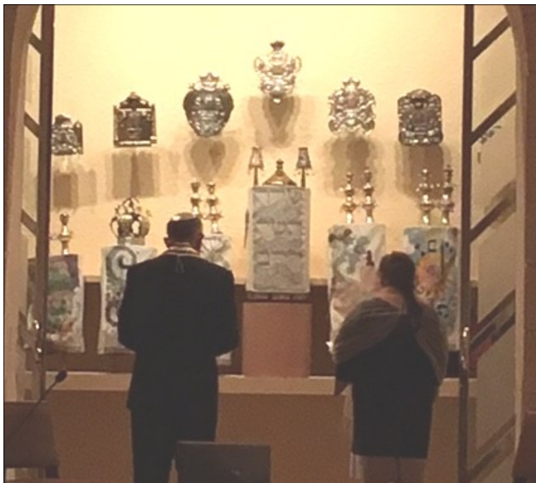
(left) The Torah covers changed to High Holy Days dress.