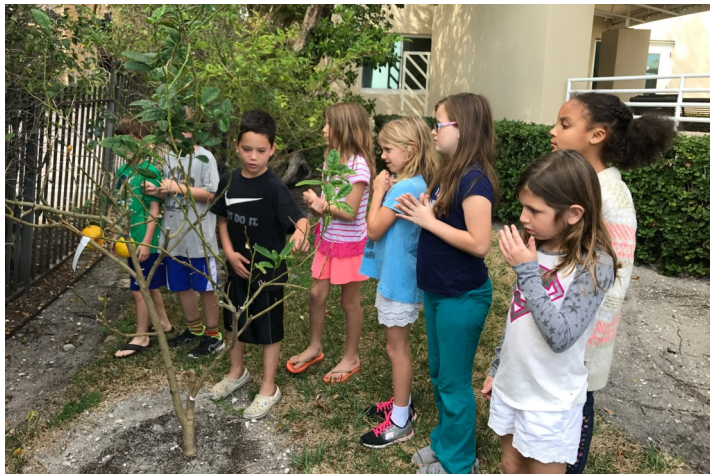
Our 2nd & 3rd graders check out the growth of our Etrog tree