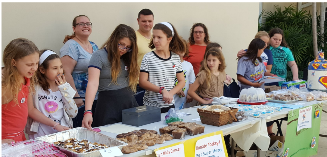
4th - 6th graders - with supportive parent volunteers - sponsored a bake sale as part of their ongoing effort to raise funds for the Kids Cancer Foundation