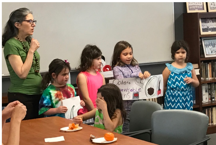
Some of our Kindergarten and first graders reminding other students to bring food for those in need

Our students learn best through experiences where they can live their values and experience Jewish life in real time. Our Purim celebration will offer the best of both. You are welcome to join us – just please let me know if you'd like to participate by emailing me at iris@temple-israel.com