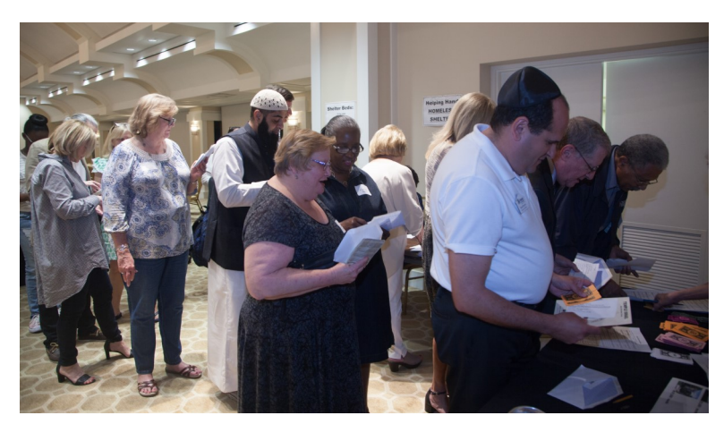
Long Lines to Find Jobs and Housing