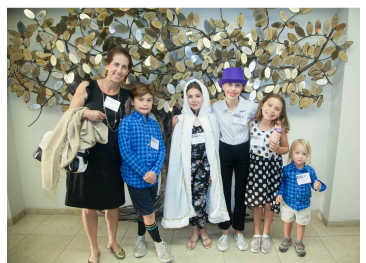
Families come for the Purim Celebration - Some Dressed in Costume