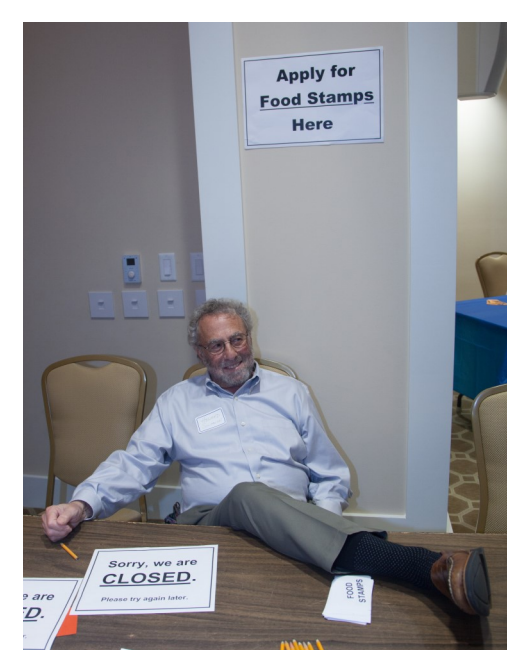
Food stamp office closed while there were people still in line, seeking help