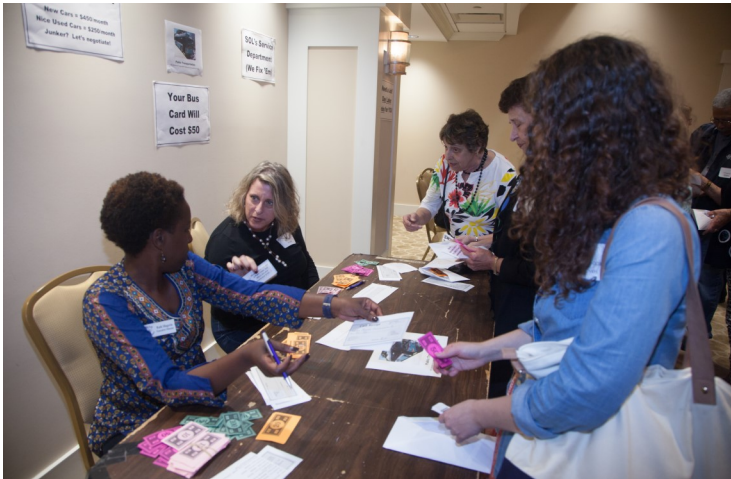
If fortunate enough to get a job, the next step is to secure transportation