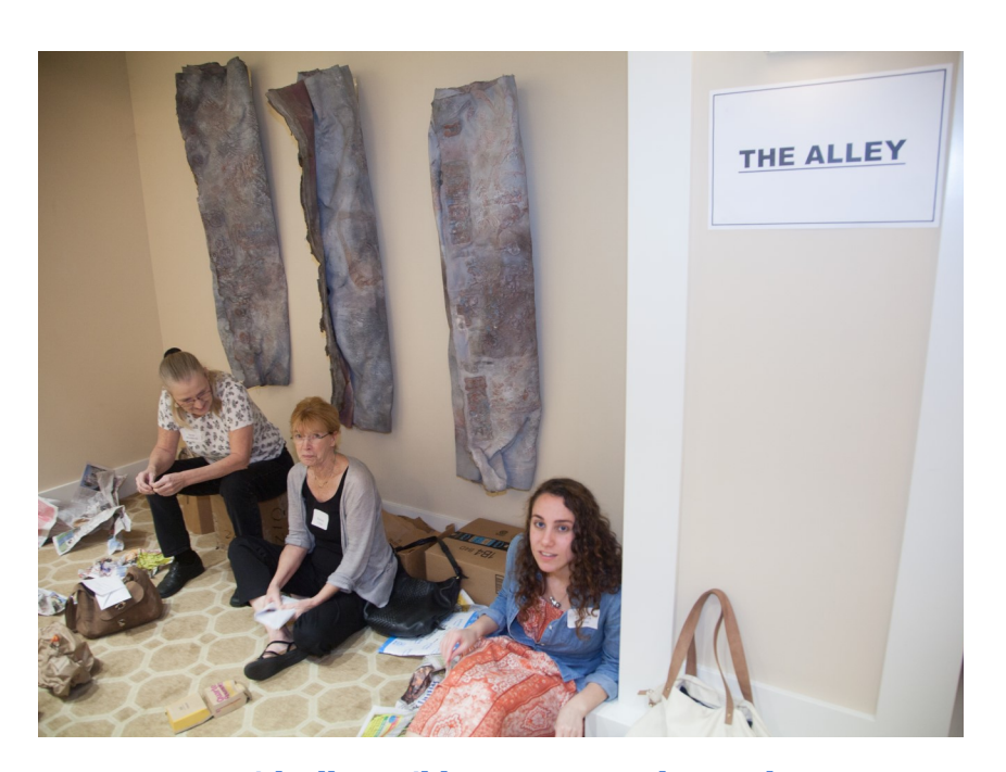
With all possible resources exhausted, the only option left is homeless in the alley