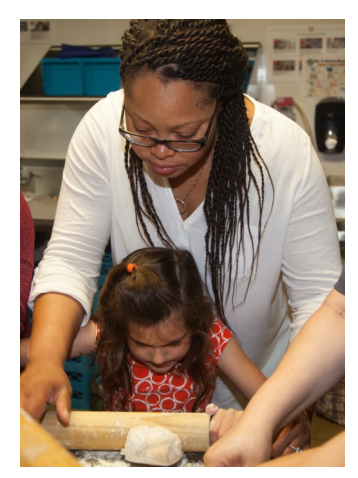
A Religious School Child Gets Assistance in Making Hamantaschen for Purim